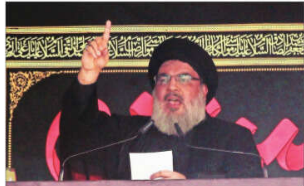
Lebanese militant group confirms death of Nasrallah, whose killing could reshape conflicts across the Middle East

Hours before the strikes, Prime Minister Benjamin