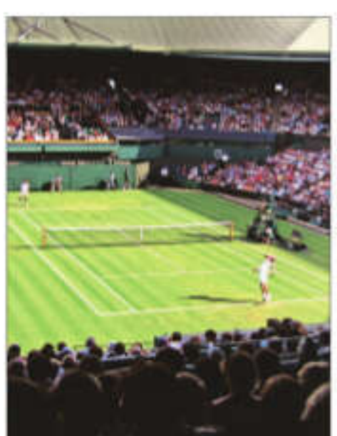
Plans approved despite environmental concerns

Protesters assembled outside City Hall ahead of the hearing on Friday and a number spoke in the chamber during a morning session lasting more